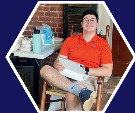
In my natural state - sitting on the Lawn with lots of bagels!

Going forward, I'm excited to widen our network of supporters and lay a foundation that'll ensure Jewish UVA students can enjoy the home the BJC provides for years and years to come. From the bottom of my heart, thank you so much for providing for a strong Jewish future here at UVA and beyond.